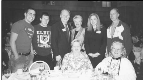
Steve Chabot celebrating his birthday with a group of friends at the Ohio Congressional Breakfast .