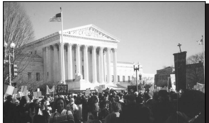
The tens of thousands of Pro-Lifers attend the March for Life 2002.

As marchers gathered near the Washington Monument the energetic crowd listened and cheered when President George W. Bush spoke to